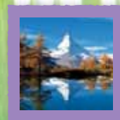
Perfect for use near parks, streams & lakes